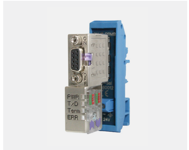
PBMA (incl. active adapter PBMB)