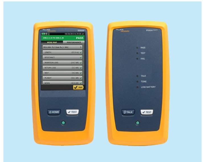
Cable tester ETHERtest V5.3