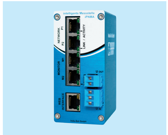
Intelligent Measuring Point iPNMA

For integrating the intelligent PROFINET measuring point into the PROmanage® NT software, 16 licensed ports are required for each iPNMA.