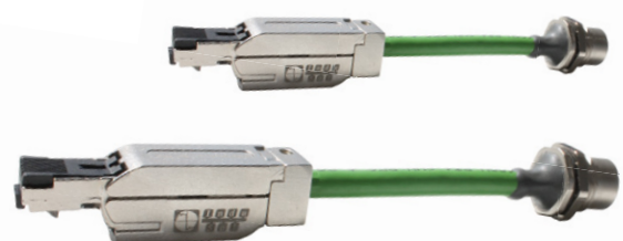
Adapter set with RJ45 plug on M12 socket for PROFINET