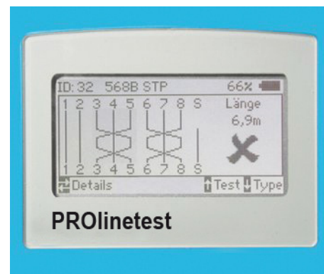
Example of error diagnosis