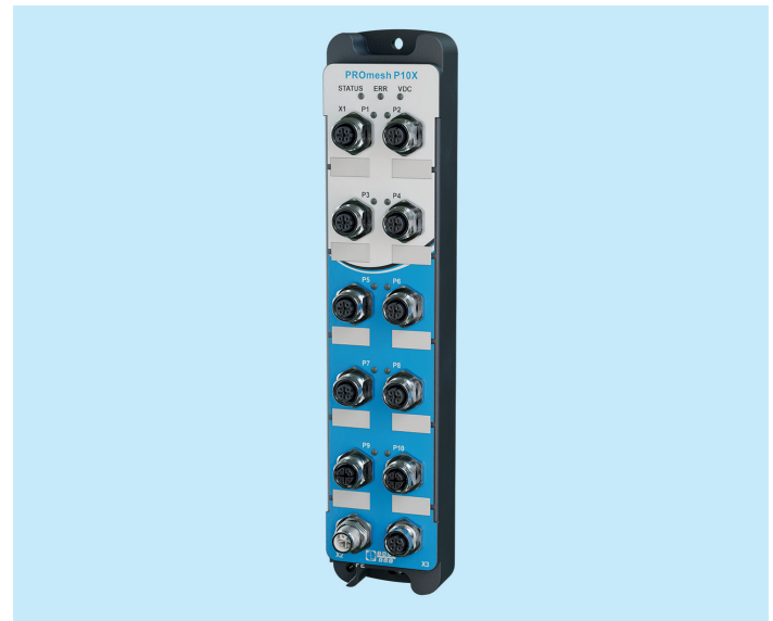
PROFINET Switch PROmesh P10X